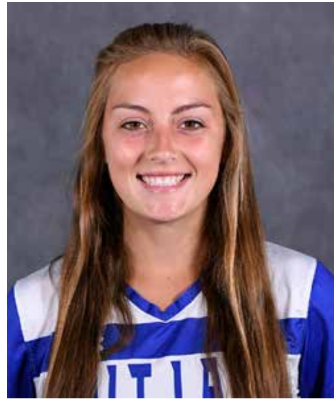
#15 Summer Miles